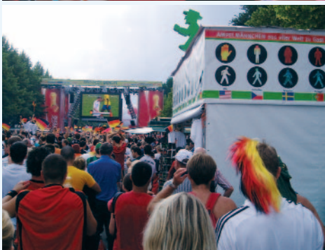
“Public viewing” at the Fan-Meile in Berlin, Straße des 17. Juni.