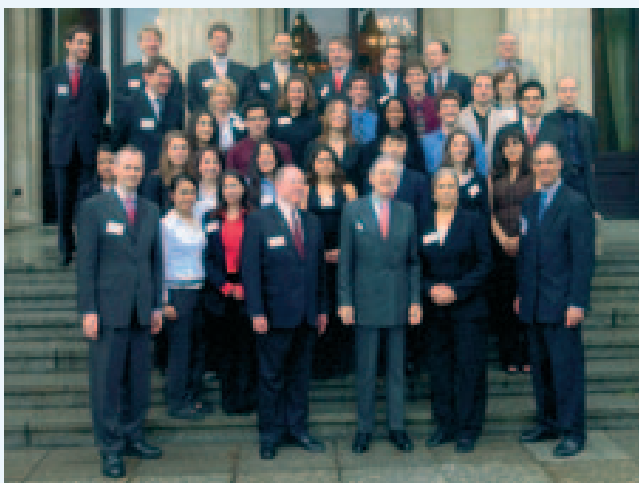
Stanford students and faculty together with Prof. Dr. h.c. mult. Berthold Beitz, Krupp Foundation officials, and members of the Stanford Club of Germany at the Villa Hügel in May 2006.

Prof. Dr. h.c. mult. Berthold Beitz Vorsitzender und geschäftsführendes Mitglied des Kuratoriums der Alfried Krupp von Bohlen und Halbach-Stiftung