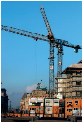
Erecting the new US Embassy on Pariser Platz next to the Brandenburg Gate. Above: perspectives of the model of the new embassy.

Working in the Embassy, I seem to straddle both worlds in a culture that is both German and American and neither. We have separate vending machines for dollars and euros. We work with a majority German staff that is managed by an American minority. The management of my German staff, then, emerged as one of my biggest challenges as I balanced differing cultural →